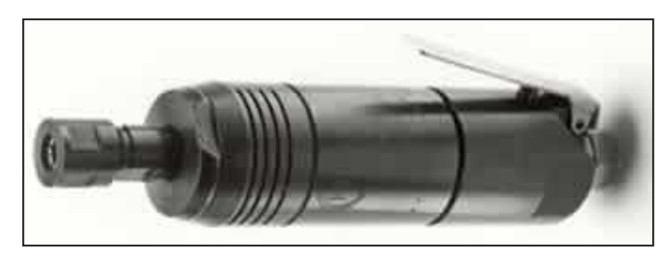
GOVERNED SPEED DIE GRINDER WITH ERICKSON COLLET FEATURING A SIDE EXHAUST